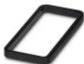
Profile gasket for type B16 supporting base element

Profile gasket - HC-B 16-PR-DI - 1661079