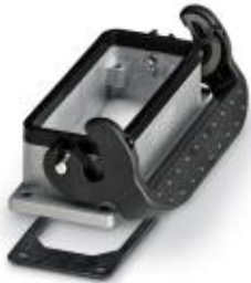
HEAVYCON B16 panel mounting base, with single locking latch, height: 29 mm, with flat gasket

Please be informed that the data shown in this PDF Document is generated from our Online Catalog. Please find the complete data in the user's documentation. Our General Terms of Use for Downloads are valid ( http://phoenixcontact.com/download )