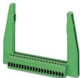
19" plug-in card block, number of positions: 20, pitch: 5 mm

Please be informed that the data shown in this PDF Document is generated from our Online Catalog. Please find the complete data in the user's documentation. Our General Terms of Use for Downloads are valid ( http://phoenixcontact.com/download )