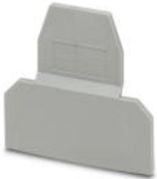
End cover, Length: 56 mm, Width: 2.5 mm, Height: 52 mm, Color: gray

Please be informed that the data shown in this PDF Document is generated from our Online Catalog. Please find the complete data in the user's documentation. Our General Terms of Use for Downloads are valid ( http://phoenixcontact.com/download )