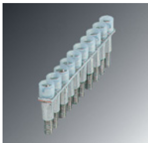
Fixed bridge, pitch: 5 mm, number of positions: 10, color: silver

Please be informed that the data shown in this PDF Document is generated from our Online Catalog. Please find the complete data in the user's documentation. Our General Terms of Use for Downloads are valid ( http://phoenixcontact.com/download )