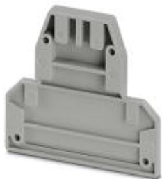
Spacer plate, to compensate for level offsets, length: 56 mm, width: 2.5 mm, height: 52 mm, color: gray

Please be informed that the data shown in this PDF Document is generated from our Online Catalog. Please find the complete data in the user's documentation. Our General Terms of Use for Downloads are valid ( http://phoenixcontact.com/download )