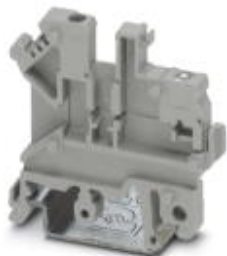
Screw flange, Mounting type: NS 35/7,5, NS 35/15, NS 32, Number of positions: 1, Pitch: 5.08 mm, Width: 5.08, Color: gray

Please be informed that the data shown in this PDF Document is generated from our Online Catalog. Please find the complete data in the user's documentation. Our General Terms of Use for Downloads are valid ( http://phoenixcontact.com/download )